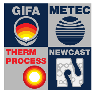
The Bright World of Metals