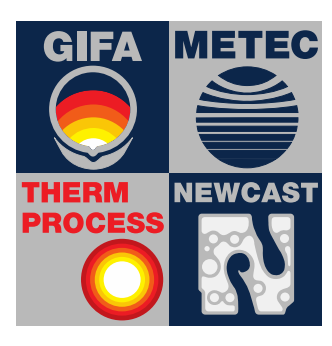
The Bright World of Metals