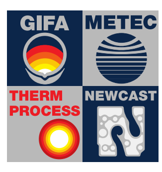
The Bright World of Metals

The second important success factor of "Bright World of Metals" is the expert supporting programme with international congresses and industry meetings such as the GIFA Conference , the European Steel Technology and Application Days/ESTAD, the European Metallurgical Conference/EMC, the THERMPROCESS symposium or the NEWCAST forum . Awards ceremonies play