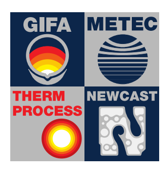
The Bright World of Metals

In its 10th edition, the International Metallurgical Trade Fair with Congresses will continue to build on its success from 2015: over 500 exhibitors from around the world will present systems for manufacturing iron ore, steel and non-ferrous metals, or for casting or moulding steel and equipment and components for metallurgical plants, rolling mills and steelworks in Halls 3, 4, and 5. The following companies have confirmed that they'll be exhibiting: Inteco (Austria), Primetals Technologies Ltd. (UK), RHI Magnesita (Austria), SMS Group (Germany), Tenova S.P.A. (Italy) and Sinosteel (China). For the first time, forged parts will also be presented at METEC. Until now, these were part of NEWCAST. However, due to their growing importance they are better suited to the Metallurgical Trade Fair.