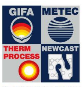
The Bright World of Metals

The next Bright World of Metals comprising the leading trade fairs GIFA, METEC, THERMPROCESS and NEWCAST will feature on the agenda in 2027; the exact dates will be announced over the next few months.