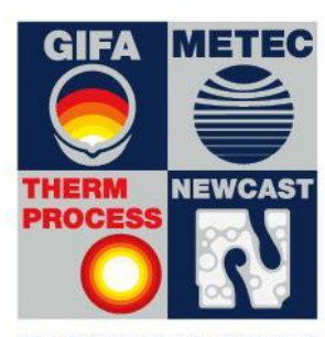
The Bright World of Metals

Current market developments, enormous challenges such as (skilled) labour shortage, extremely high energy costs that are putting a special burden on German companies, but also the opportunities that the energy transition is bringing – there was a plethora of dominating topics featured at the Bright World of Metals. Possible solutions such as the introduction of an internationally competitive electricity price for industry, for example, were discussed on the first day of the trade fair in a top-level talk between the leading minds in the industry and Mona Neubaur, Minister of Economy, Industry, Climate Protection, and Energy in North Rhine-Westphalia. These topics also determined the