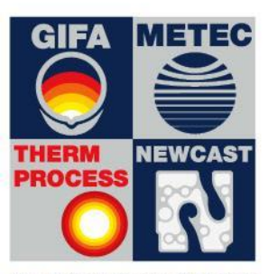
The Bright World of Metals

Forming an integral part of the Bright World of Metals since 2011, Messe Düsseldorf's ecoMetals Campaign will be a special highlight of the trade fair quartet. As an initiative promoting sustainability, it refers to the ecological path of the casting and metallurgical industries and promotes exhibiting companies that invest in innovative, sustainable and economically competitive technologies. Trade visitors can identify the eco-conscious innovations by the ecoMetals logo displayed at exhibition stands and on the online portal. At GIFA, METEC, THERMPROCESS and NEWCAST visitors